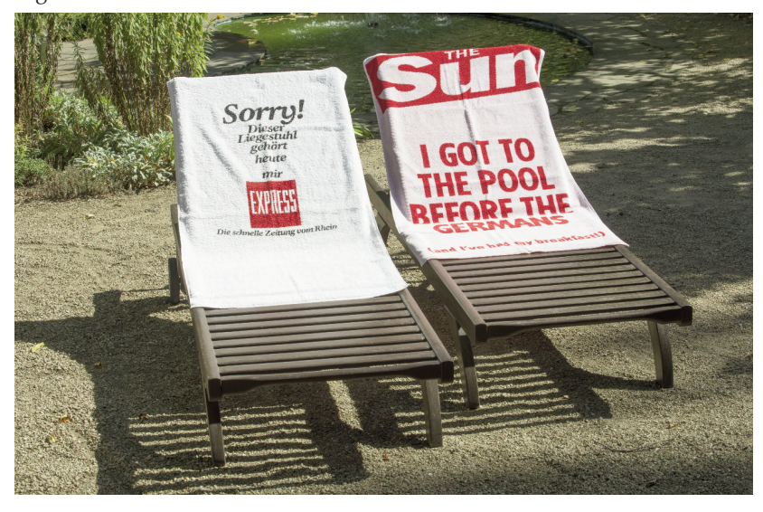
Fig. 1: The War of the Towels

The German-British war of the towels for pool chairs was waged mainly in the tabloids. German Express: 'Sorry! This pool chair is mine for today'; British Sun: 'I got to the pool before the Germans (and I've had my breakfast!).'