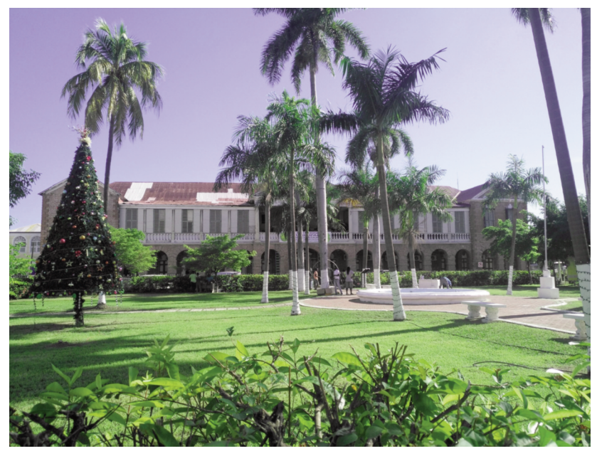
Christmas Tree, Emancipation Square, Spanish Town, Jamaica.

trees in those very squares, surrounded by palm trees. It is also here that the kernel of London's British Museum and Natural History Museum collection was compiled by Sir Hans Sloane in the eighteenth century. The transatlantic slave trade provided the infrastructure that allowed Sloane and his European contemporaries to build their collections, and supplied specimens for Sloane and others, as James Delbourgo has compellingly shown in his book Collecting the World .<sup>1</sup>