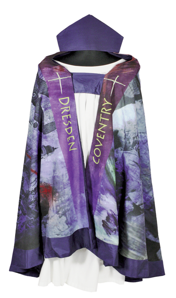
Fig. 2: Coventry-Dresden Cope

Photograph credit: Stiftung Haus der Geschichte/Axel Thünker. Reprinted by permission.