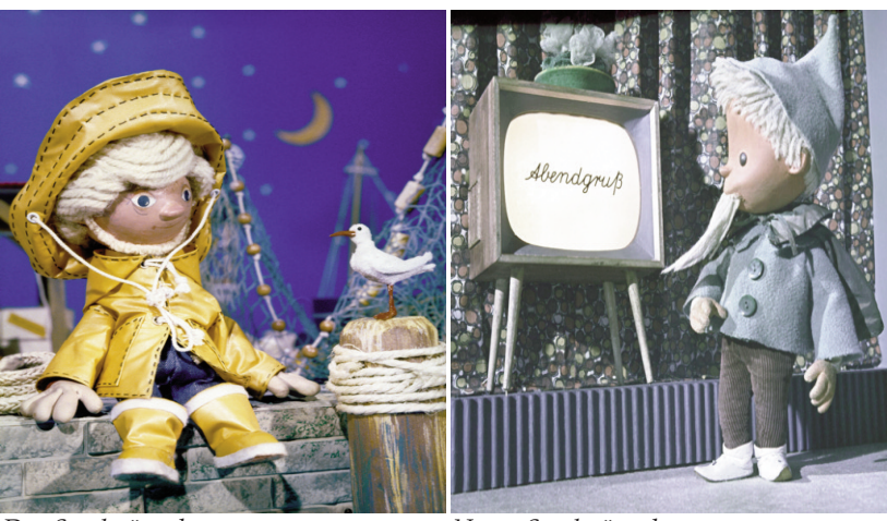
Das Sandmännchen

German Television's Little Sandman Puppets in the West (left) and East (right)